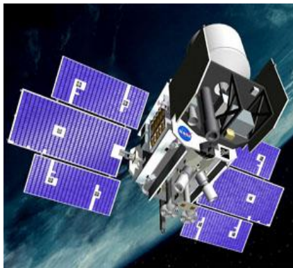
Figure 1: ICESat/GLAS satellite

The main instrument on ICESat is Geoscience Laser Altimeter System (GLAS) with three lasers. The orbital altitude of ICESat is 600km with an inclination 94 degree and 183 day repeat pattern. GLAS is the first laser ranging instrument which enabled the continuous global observation of Earth. GLAS was successfully launched on January 12, 2003 aboard the ICESat from Vandenberg Air force Base. National Aeronautics and Space Administration (NASA) Goddard Space Flight Centre (GSFC) designed and implement the measurement instrument GLAS. The term altimetry is used for the range measurement to the earth surface. The three lasers namely laser1, laser2 and laser3 were mounted on a rigid optical bench with one laser operating at a time producing a 1024 nm pulse. The first laser operated from February 20, 2003 but failed on March 29, 2003. It had 119 equally spaced ground tracks to cover the earth with 8 day repeat orbit. Laser 2 also stopped working on October 2009 due to the energy loss caused by photo darkening near the laser frequency doubler. Laser 3 worked for 14 days and stopped working in October 2008. ICESat carried about 18 laser campaigns and remained seven years in orbit. [3], [4], [5], [6], [7]. Figure 2 illustrates how the GLAS instruments on Earth surface.